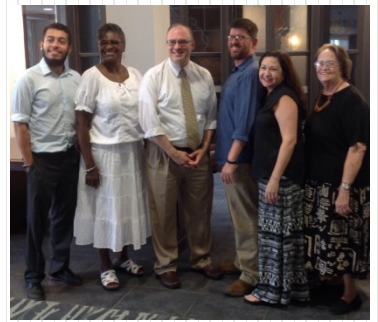
The ASL Project Team

It's here! United Methodist Communications in collaboration with The United Methodist Committee on Deaf and Hard-of-Hearing Ministries, The General Board of Global Ministries, produced a small library of United Methodist terms in ASL as a part of the denomination's glossary. Deaf, hard-of-hearing, late-deafened, Deaf-blind individuals and their families, as well as others who are interested, are able to access the online glossary by going to www.umc.org/what-we-believe/glossary .