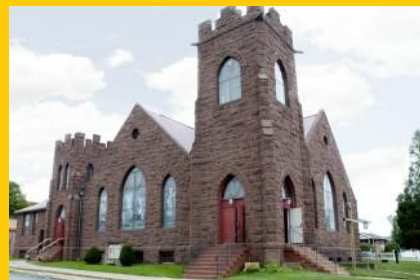
First United Methodist Church

First United Methodist Church of Reynoldsville, PA began its Deaf ministry in 2016. With prayer and commitment by church leadership, it began offering a weekly interpreted ministry, sign language classes, community support, and most recently, a Deaf ministry training. Their Sunday worship service is at 10:30am. To learn more about the ministry or the church, check out the church's website at http://fumcreynoldsville.org .