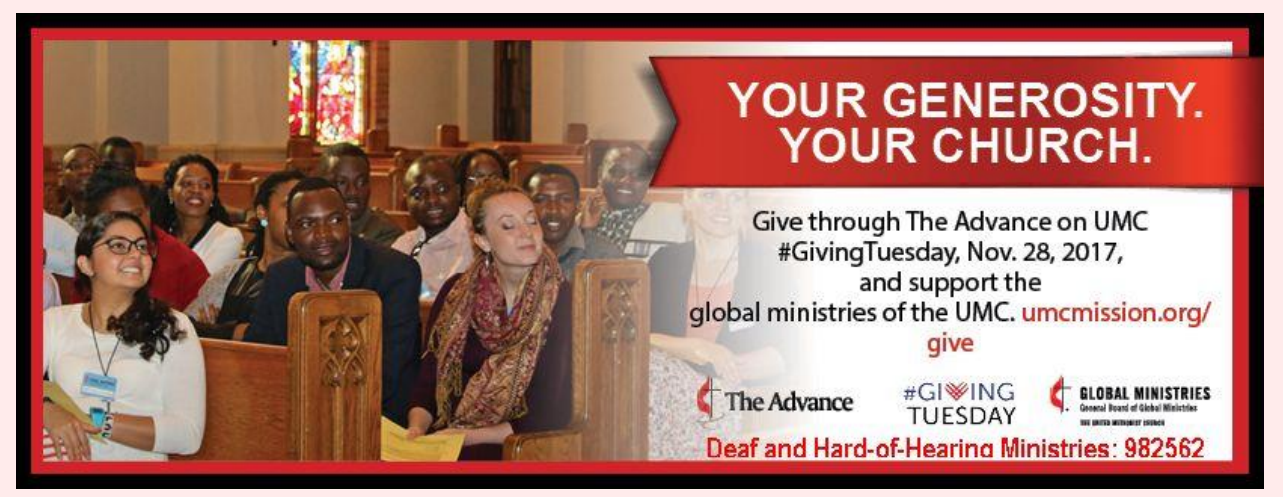
[Image description: A congregation with the message "Your Generosity. Your Church." that invites people to support the Deaf and Hard of Hearing Ministries Advance.]

The United Methodist Committee on Deaf and Hard of Hearing Ministries serves those who are Deaf, hard of hearing, late-deafened, and Deafblind. This is most prominent when we provide grants to ministries, churches, districts, and annual conferences who in turn support the ministry, inclusion, accessibility, and empowerment of this population. With your help, the United Methodist Committee on Deaf and Hard of Hearing Ministries can continue to support programs and ministries, which include leadership development. Won't you consider a donation on Giving Tuesday on Tuesday, November 28th? Every dollar counts.