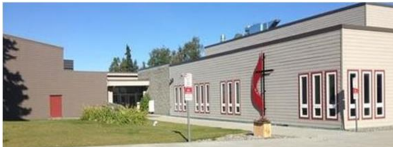
Image Description: Church building with flame & cross

A few Deaf Ministries that stands out in this quarter's newsletter are St. John UMC in Anchorage, AL, the Deaf & Mute Ministry in the Philippines, and St. Paul UMC in Odessa, DE.