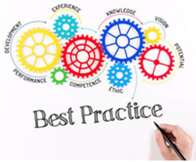
Image Description: Wheels with BEST PRACTICE written out