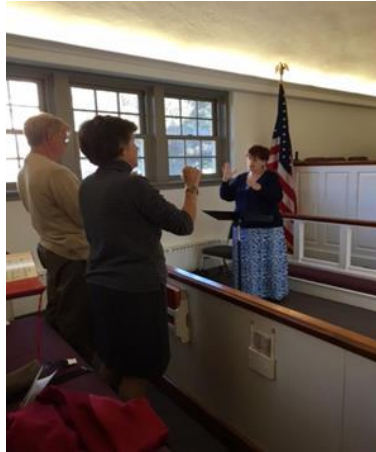
Image Description: 2 Deaf persons signing along with an interpreter in worship.

This new Deaf Ministry in the Philippines were invited to perform songs in sign language.