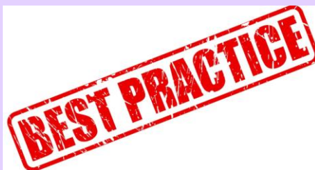
[Image Description: The words "Best Practice" stamped on a piece of paper.]

A few ways to recruit a freelance interpreter include: a search through The Registry of Interpreters for the Deaf (RID) – search freelance interpreters by state, try searching through the state chapter of RID , checking with the state Vocational Rehabilitation office for suggested list of interpreters, and exploring a possible nearby college or university interpreting education programs (for a student interpreter). Like with most church positions, planning ahead of time for coverage is always best. Certainly, making arrangements through an agency is the simplest or fastest way, but is typically the more expensive route (search for agencies in your state here ).